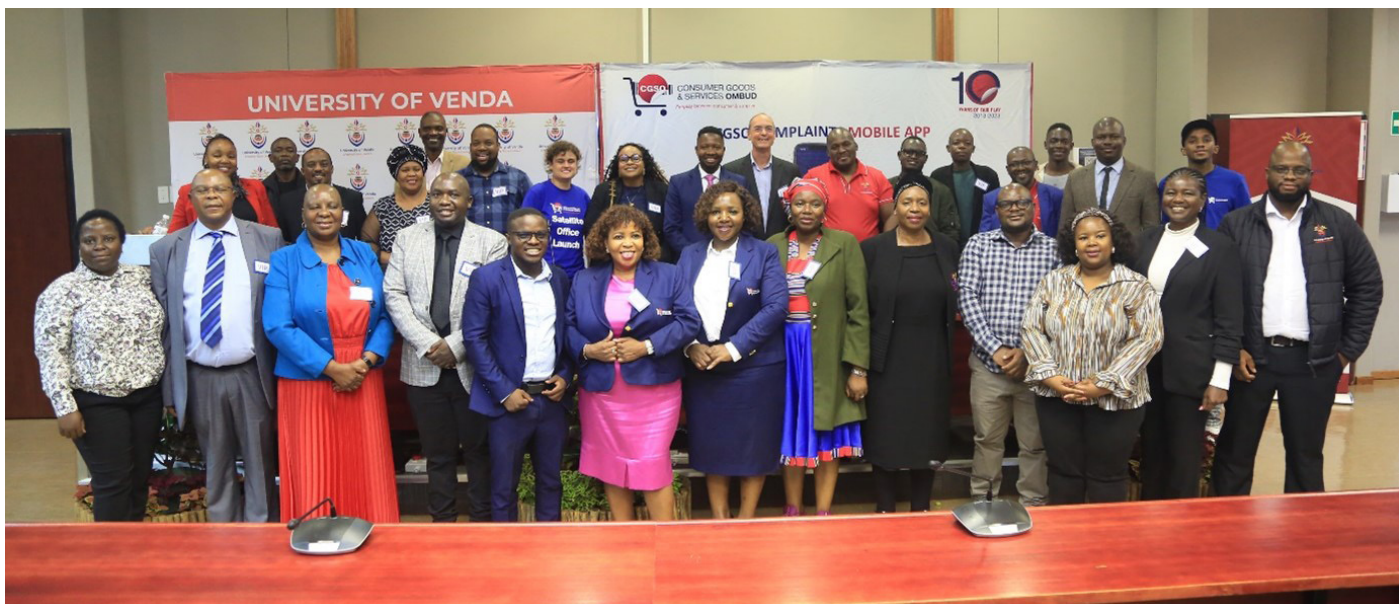
Group photo of delegates