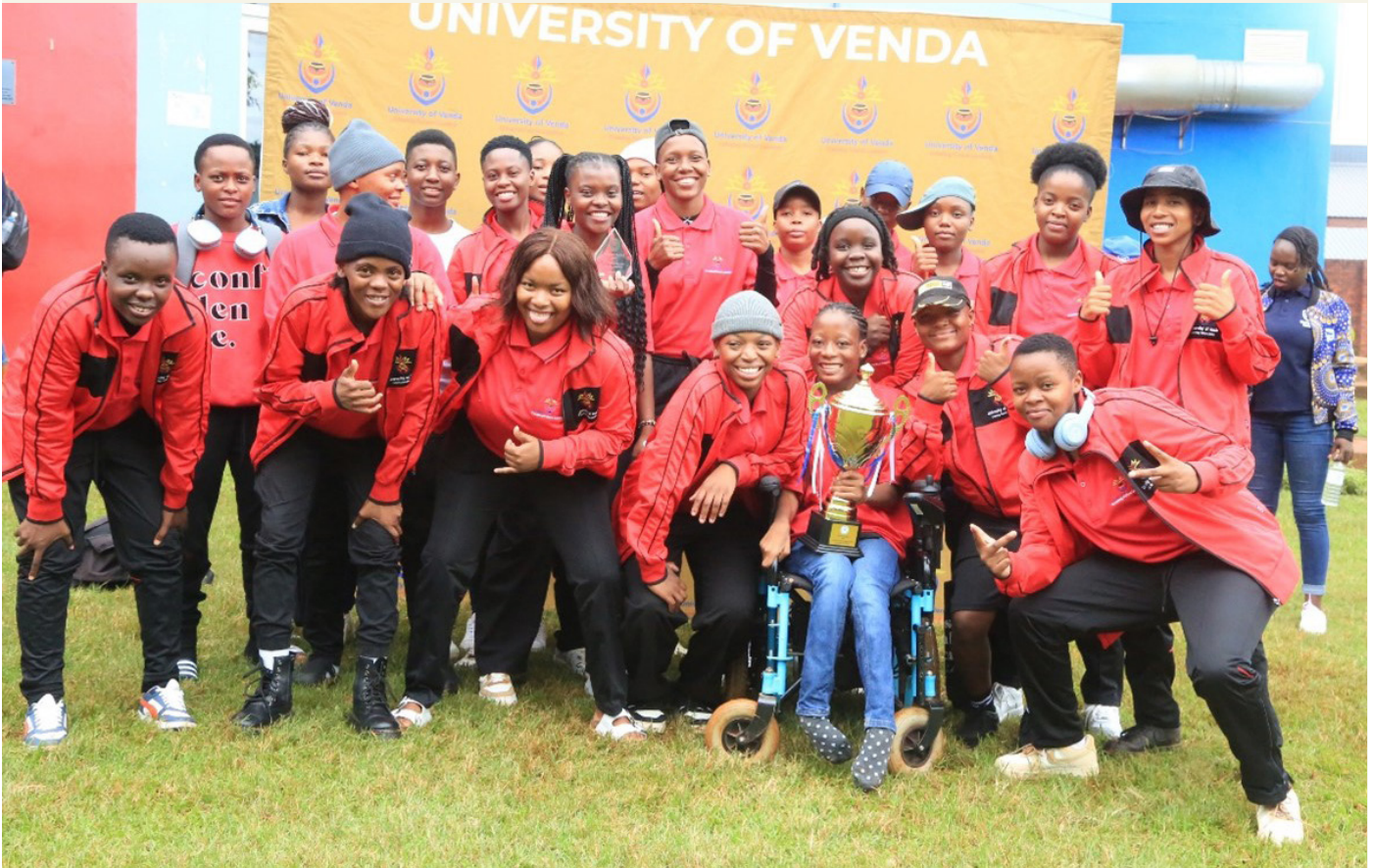
We are the winners

On Friday, 21 February 2025, the University of Venda (UNIVEN) Sport and Recreation Unit hosted an unforgettable Trophy Hand-over Function in honour of the Ladies Football Club's incredible achievement. The event, held at the Student Centre Building—Student Parliament Hall, marked a historic moment for the university as the female football team successfully qualified for the 2025 Varsity Football Cup later this year.