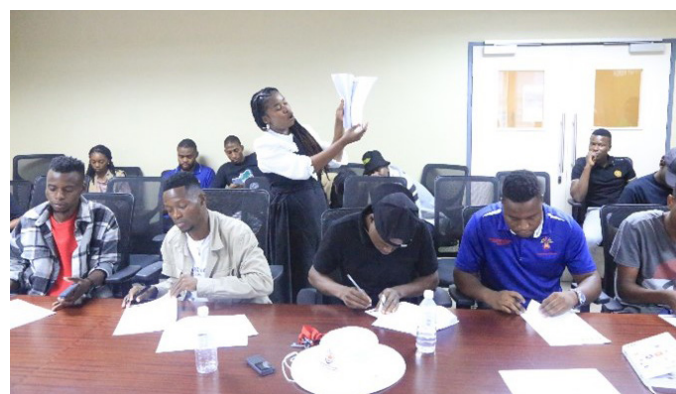
Some of UNIVEN students signing the bursary agreement