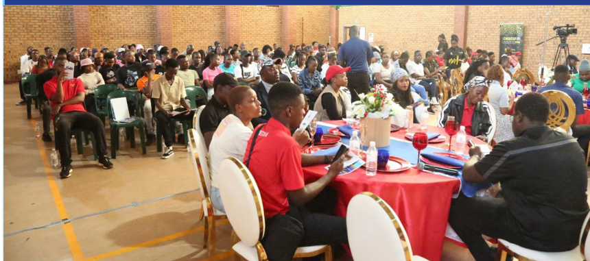
Attendees of the World Radio Day Commemoration and Phalaphala FM's Birthday Celebration at UNIVEN Sports Hall

On Thursday, 13 February 2025, the University of Venda celebrated World Radio Day under the theme: "The Role of Radio in Educating Communities about Climate Change." The event drew students, staff members, including representatives from local radio stations such as Phalaphala FM, UNIVEN FM, Vhembe FM, Choice FM, and Makhado FM. This event was held at the University's Sports Hall.