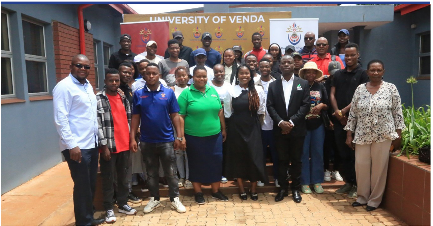
Bursary beneficiaries posing with UNIVEN and PSETA staff members