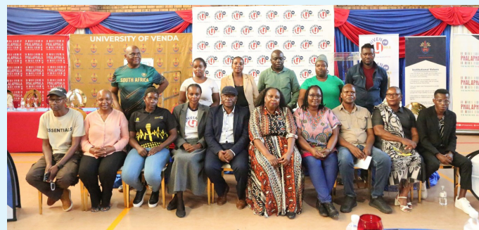
A group photo of stakeholders from various radio stations

The event marked a significant step in fostering collaboration between radio stations and the University of Venda, reinforcing the collective effort to combat climate change and promote sustainability.