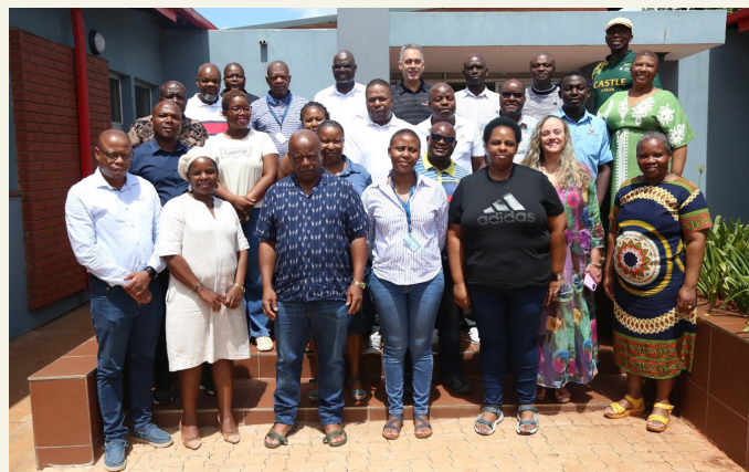
Attendees of Performance Management Training

and maintain its reputation as a center of academic and administrative excellence.