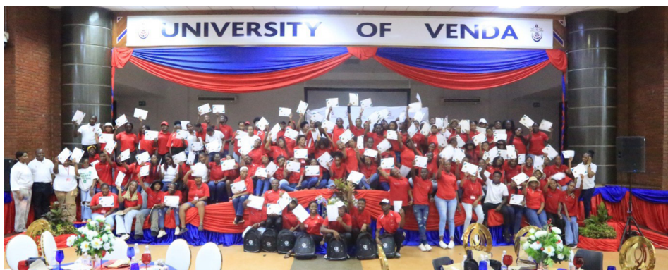
On Photo: Group photo of Peer Educators posing with their certificates

The University of Venda (UNIVEN) Campus Health hosted a special farewell event for its dedicated Peer Educators who have been instrumental in promoting health and wellness across the University community. The event celebrated the outstanding contributions of these student leaders, who have worked tirelessly to support their peers through education and advocacy on various health matters. The farewell function took place on Monday, 18 November 2024, at the University Auditorium.