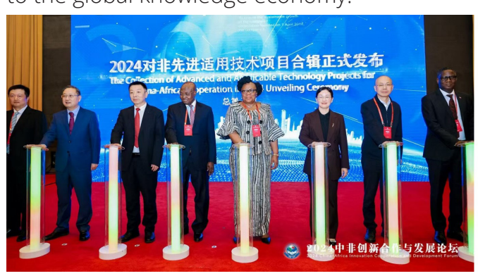
Advanced applicable technology projects for China-Africa Cooperation 2024 unveiling ceremony

As UNIVEN continues to build on its partnerships in China, it is positioning itself as a leader in green technology and sustainable development. The university's participation in these international forums reflects its commitment to advancing research, fostering innovation, and contributing to the global knowledge economy.