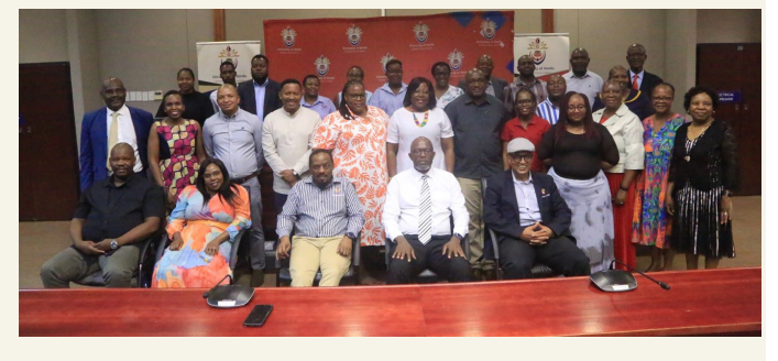
A group photo of DHET delegates with UNIVEN staff members at Research Conference Centre

The visit concluded with an emphasis on the collaborative effort between DHET and UNIVEN to ensure that the objectives of the Sibusiso Bengu Development Programme are met, ultimately advancing the broader goals of higher education transformation in South Africa.