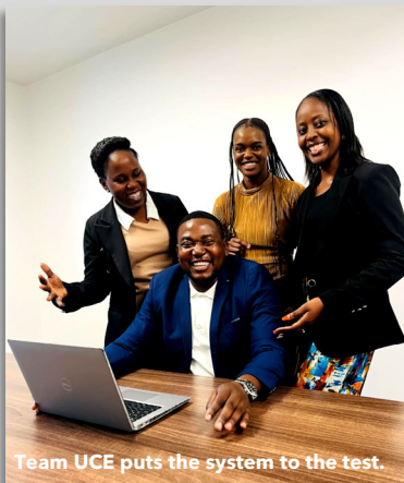
Team UCE puts the system to the test.

UNIVEN Continuing Education (UCE) recently cemented its presence in the online learning domain with the piloted roll-out of the first two courses being attended in the virtual space.