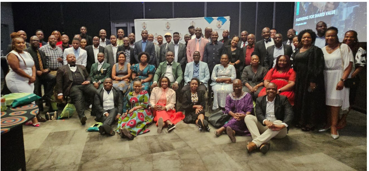
On photo: Some of the Alumni pose for a photo with the University Executive Management

Over 200 alumni attended the gathering that fostered networking opportunities, creating a platform for the university to engage with successful graduates. Alumni shared inspiring stories, offered valuable advice, and demonstrated the impact of their university education on their careers. The evening showcased the strong bond between the university and its graduates, highlighting a sense of community and pride. As former students reflected on their academic journey and professional accomplishments, the event reinforced the importance of education and mentorship in shaping successful careers. The atmosphere was filled with excitement and nostalgia as attendees reminisced about their time at the university and shared their professional journeys.