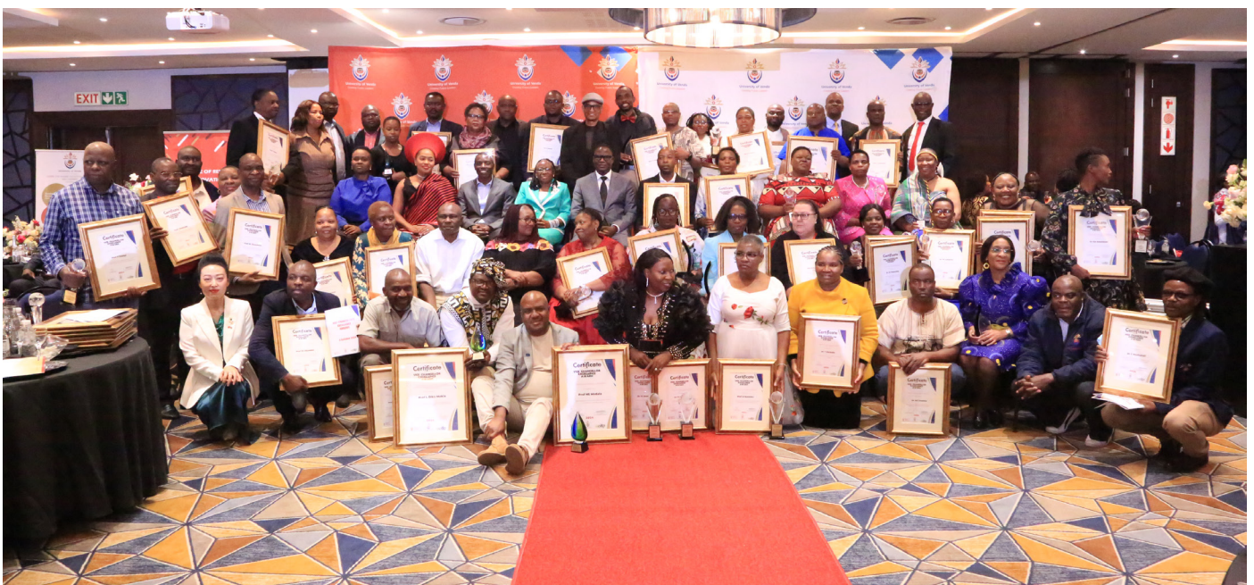
On photo: Awardees posing with the University Management after receiving their well deserved awards