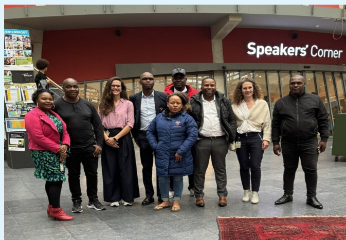
UNIVEN delegation at The Hague University of Applied Sciences (THUAS), Netherlands

Legal Agreements and Compliance: The legal teams collaborated to develop templates for partnership agreements, memoranda of understanding (MoUs), and research contracts. With increasing regulatory demands in higher education, they emphasised risk management, intellectual property rights, and ethical considerations in research, laying a solid legal foundation for future collaborations. Additionally, UNIVEN was granted permission to explore an in-house digital solution for managing contracts.