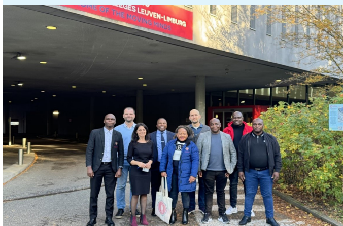
UNIVEN Delegation at the University Colleges Leuven-Limburg (UCLL), Belgium

Key Goals of the Strategic Sessions included: Exploring Partnership Models: Participants evaluated various partnership models in academic exchange, research collaboration, and dual-degree programmes. Enhancing Student and Staff Mobility: The discussions aimed to identify pathways for student exchanges, internship opportunities, and short-term staff visits.