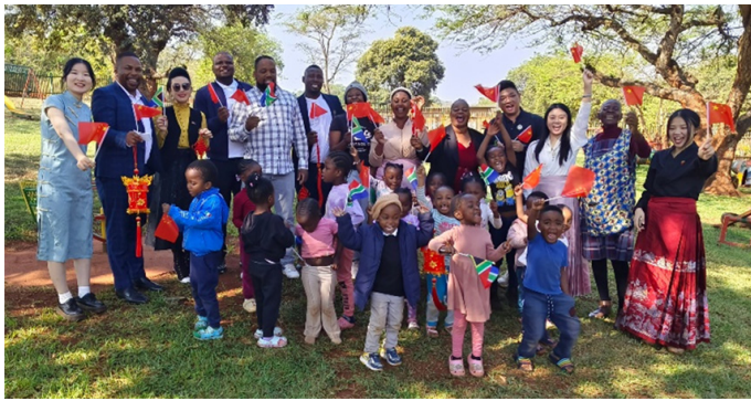
New Beginnings at UNIVEN Experimental Kindergarten

by opening several teaching sites across Limpopo, catering to children, teenagers, and adults in local communities.