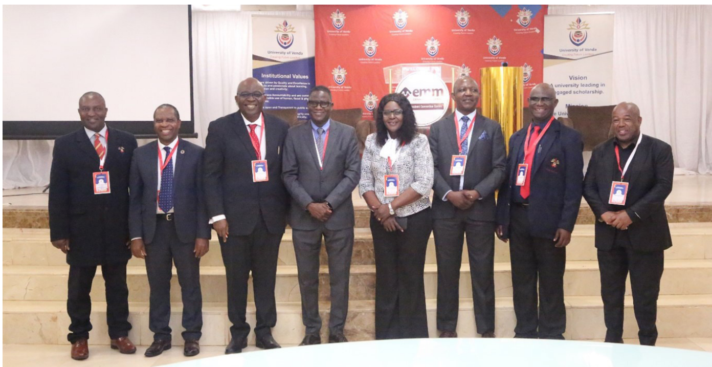
Official opening ceremony speakers posing for a group photo at 2Ten Hotel

“The study’s outcomes reinforce the view that universities should be recognised as essential actors in the international development space and supported by donors to deliver projects that drive progress towards global goals. Universities here and elsewhere in the continent have multifaceted roles and mandates to lead through the production of Research, Teaching and Learning, and Community Engagement.”