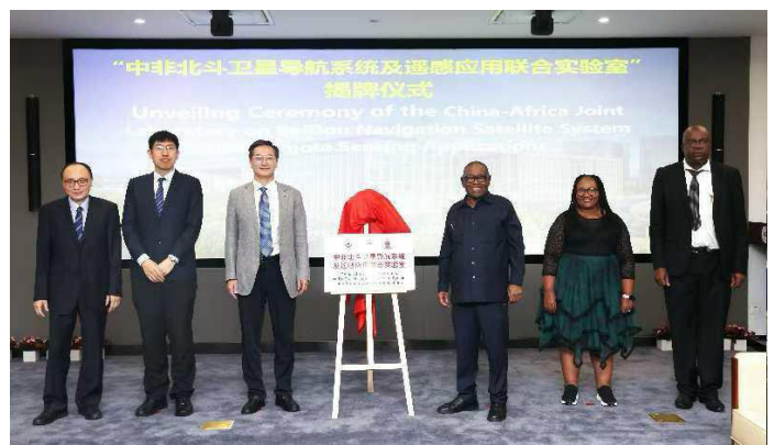
Dr Blade Nzimande, Hon. Minister for Science and Innovation, Unveiling the plaque for the Joint Laboratory on BeiDou Navigation Satellite System and Remote Sensing

UNIVEN, in partnership with Beihang University, has been awarded a Joint Laboratory on BeiDou Navigation Satellite System and Remote Sensing by the South African and Chinese governments.