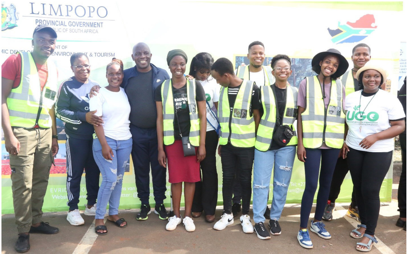
Students who will be travelling to Botswana for global environmental studies