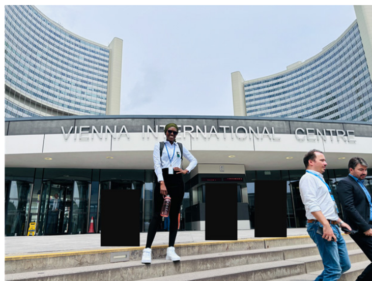
At the Vienna International Centre in Austria, where the meeting was held for five days