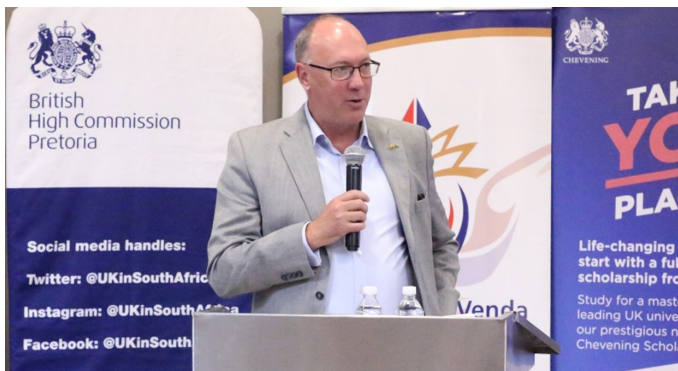
High-Commissioner H.E Anthony Philipson

The Question-and-Answer session on UK-South Africa Relations by the British High Commissioner, H.E. Antony Phillipson, presented a unique and valuable opportunity for students and faculties to engage directly with the High Commissioner on the topics of mutual interest and significance, particularly in light of the evolving global landscape. The accompanying Chevening info session provided invaluable insights for students interested in pursuing postgraduate study opportunities in the UK.