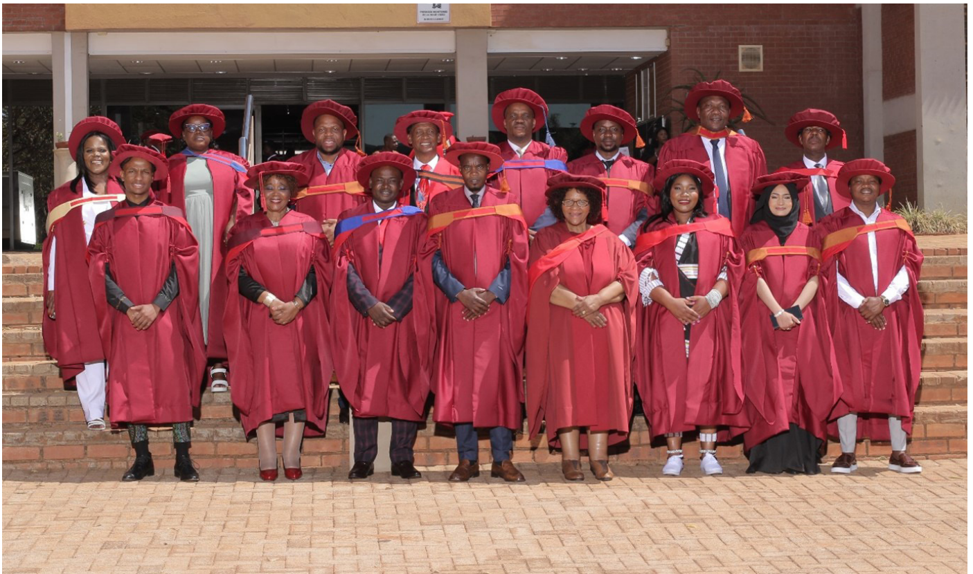
PhDs recipients from the following Faculties: Health Sciences; Management, Commerce and Law; as well as Humanities, Social Sciences and Education