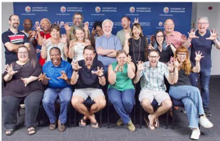
Participants at the ELEPHANT meeting held at UMP

The University of Mpumalanga (UMP) recently hosted a five-day ELEPHANT meeting at the Tfokomala Hotel and Conference Centre – together with the Steering Committee (UU, UNIBO and UP) and the Board of Representatives (UMP, UNIVEN, UL, UFH, SAWC, UP, UNIBO, and UU). An important outcome of this meeting is that South African Masters and Honours students stand to benefit from the ELEPHANT project.