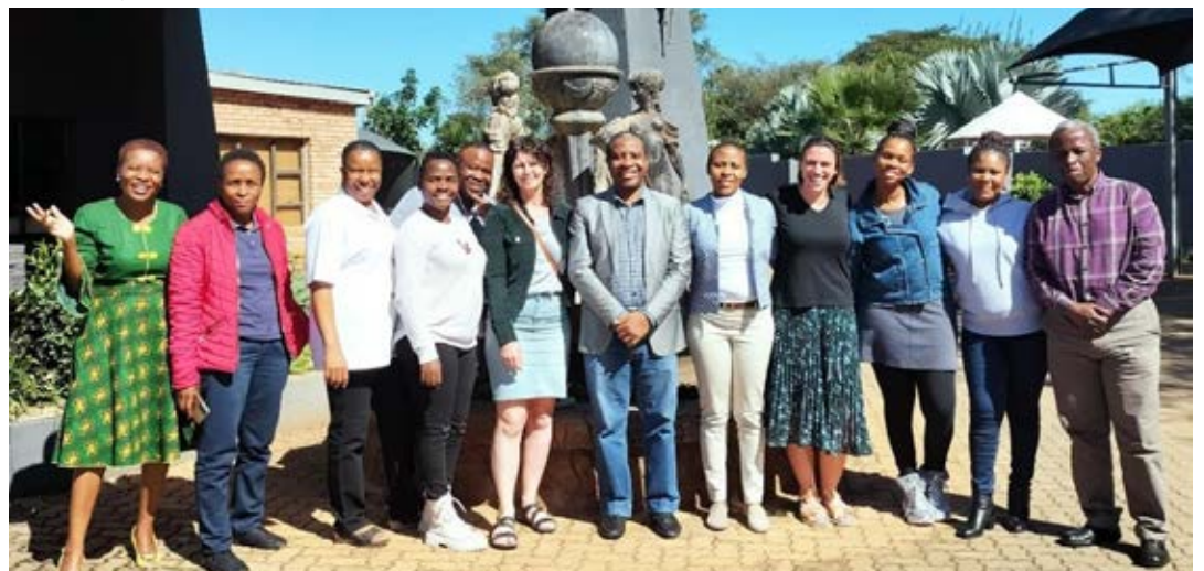
A Group Photo Day 3: UNIVEN and VIVES Colleagues