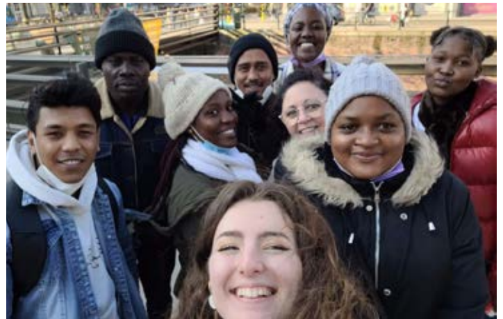
UNIVEN Students with other Students from VIVES University of Applied Sciences