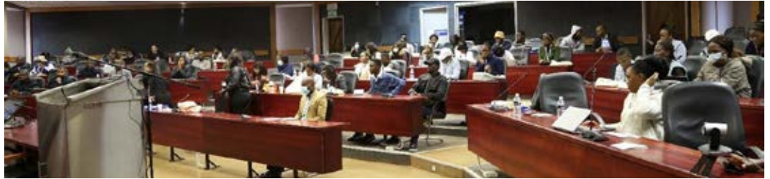
Attendees of the Faculty Research Day listening to the speaker

On 27 and 28 June 2022, the Faculty of Science, Engineering and Agriculture held the Faculty Research celebration at the University's Research Conference Centre. The purpose of the event was to showcase and celebrate research diversity within the faculty. The event had several poster and oral presentations from staff, undergraduate and postgraduate students on several research themes which included (1) Climate change, energy, agriculture and food security; (2) One Health research; (3) Natural products and Material Sciences; (4) Spatial planning, land management or rural development; (5) Biodiversity, Conservation, or ecosystem services; (6) Mathematical modelling or data sciences [including engineering innovations]; and (7) Environmental monitoring or waste management.