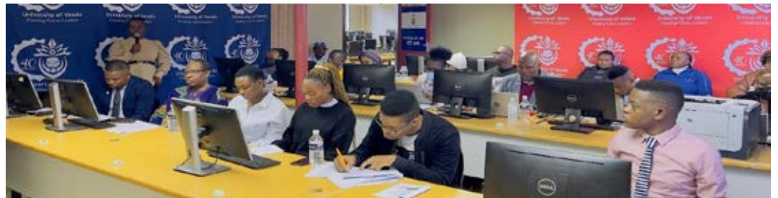
Participants in the COIL Workshop