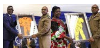
Gifts from Correctional services- these gifts were produced by inmates