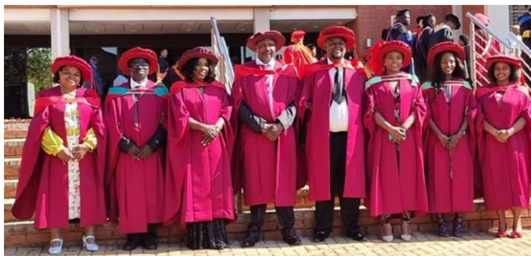
Some of the pictures taken during graduation ceremony