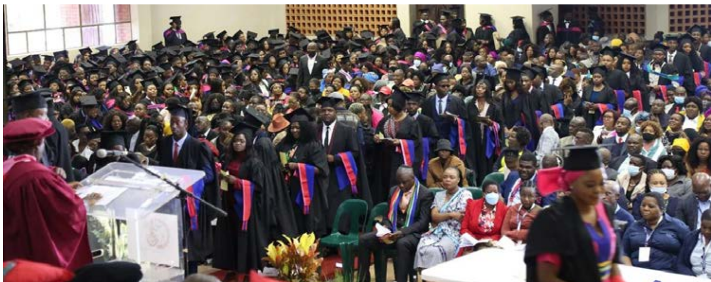
The Winter graduation Ceremonies took place at the University Auditorium on Thursday, 14 July 2022 and Friday, 15 July 2022.