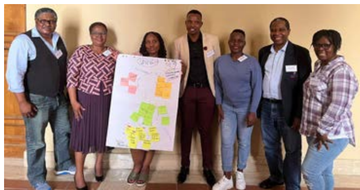
UNIVEN delegation demonstrating their map on connecting COIL for curriculum renewal. Recommendations for UNIVEN COIL