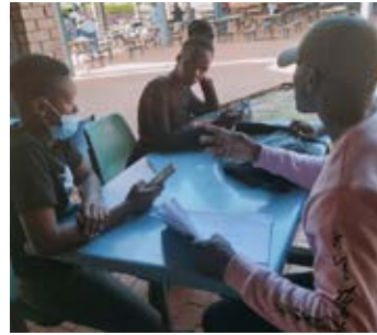
IRP officials promoting the ABE BAILEY opportunity to UNIVEN students