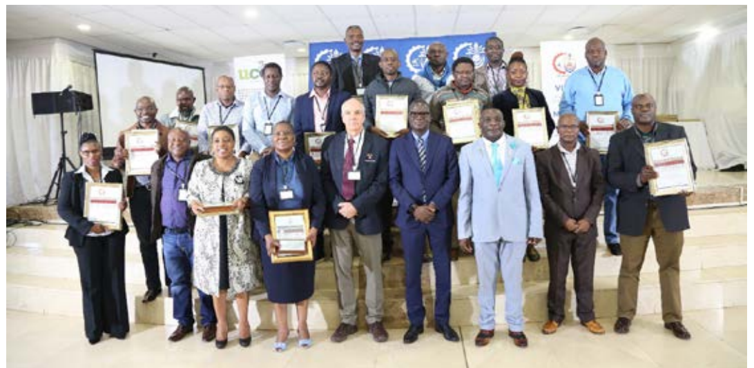
Awardees posing for a photo with Senior and Executive Management

The UCDP Vice-Chancellor's Excellence in Research Awards were for the Postgraduate Outputs for the years 2020 and 2021, Research Publications Outputs 2019-2020, and UNIVEN National Research Foundation Rated Researchers 2021 and 2022.