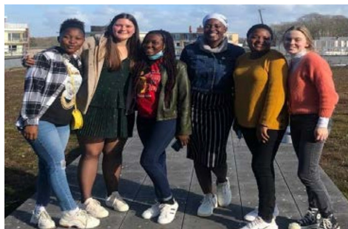
UNIVEN students at VIVES University of Applied Sciences

The main purpose of the programme was to study, discover and explore as an exchange student at VIVES University of Applied Sciences in West Flanders Belgium, which is in the heart of Europe. VIVES University of Applied Sciences with its modern and competency-based higher education is innovative in practical research and provides its services to society. It also offers an adequate response to the social challenges of today and tomorrow. VIVES is an appreciative, friendly, and people-oriented university of applied sciences that concentrate on professionally oriented bachelor's degree and associate degrees. In doing so the university ensures that its students contribute to the globalised world as both human beings and professionals.