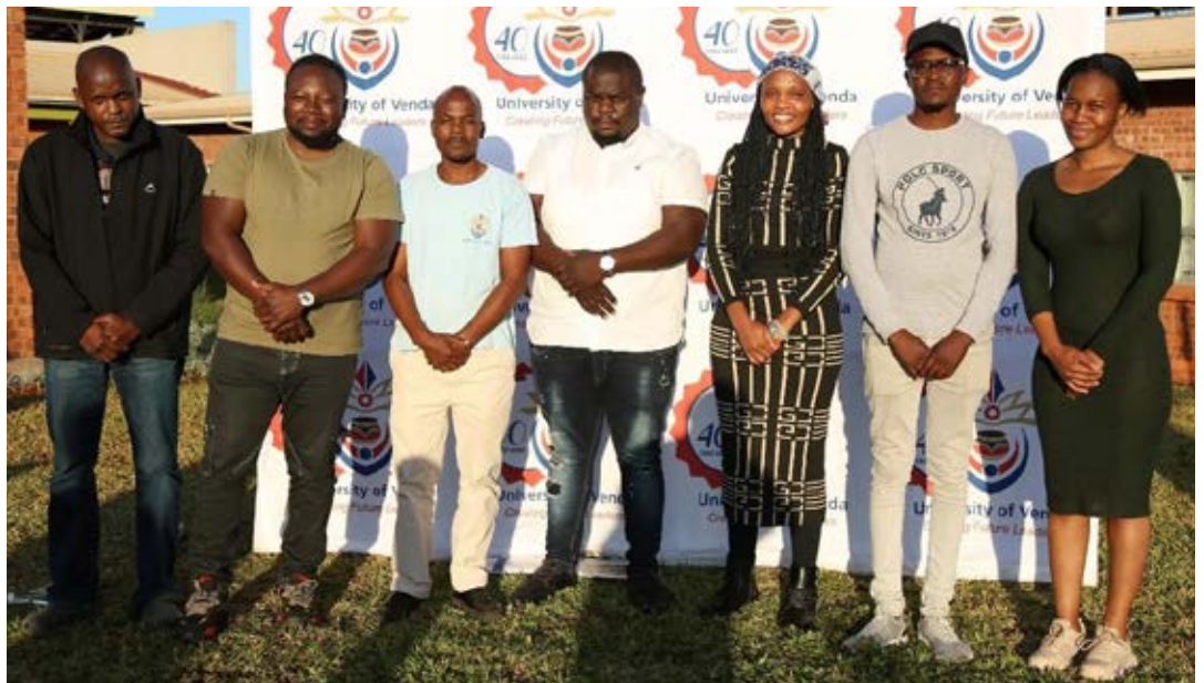
The newly elected UNIVEN Vhembe Alumni Chapter posing for a group photo

"As alumni of the University, we should contribute to the programmes of our alma mater. We should be proud of the institution that produced us because it changed us to be who we are."