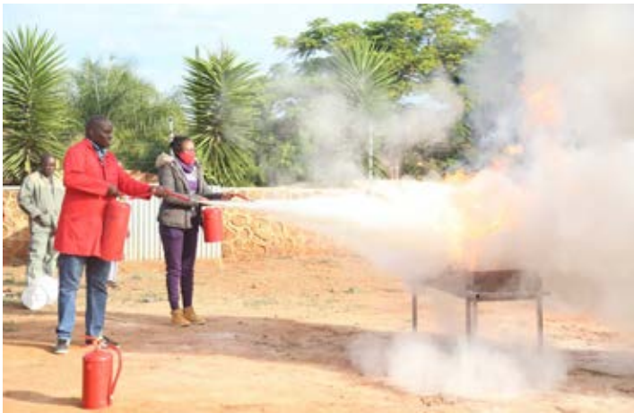
Staff members during the firefighting training

From Monday, 18th July to 22 July 2022, the University of Venda's Occupational Health and Safety (OHS) Office held the Health and Safety Workshop that included various courses to train the selected employees of the University about health and safety in the workplace. This training took place at Jericho Hotel and Resort. The courses/modules that these staff members were trained on were: First Aid Course level 2 and Fire Fighting course. Amongst the trainees were committee members for Occupational Health and Safety representatives, members were selected from different departments, directorates, and faculties.