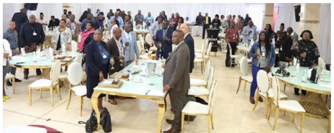
Attendees during the awards ceremony